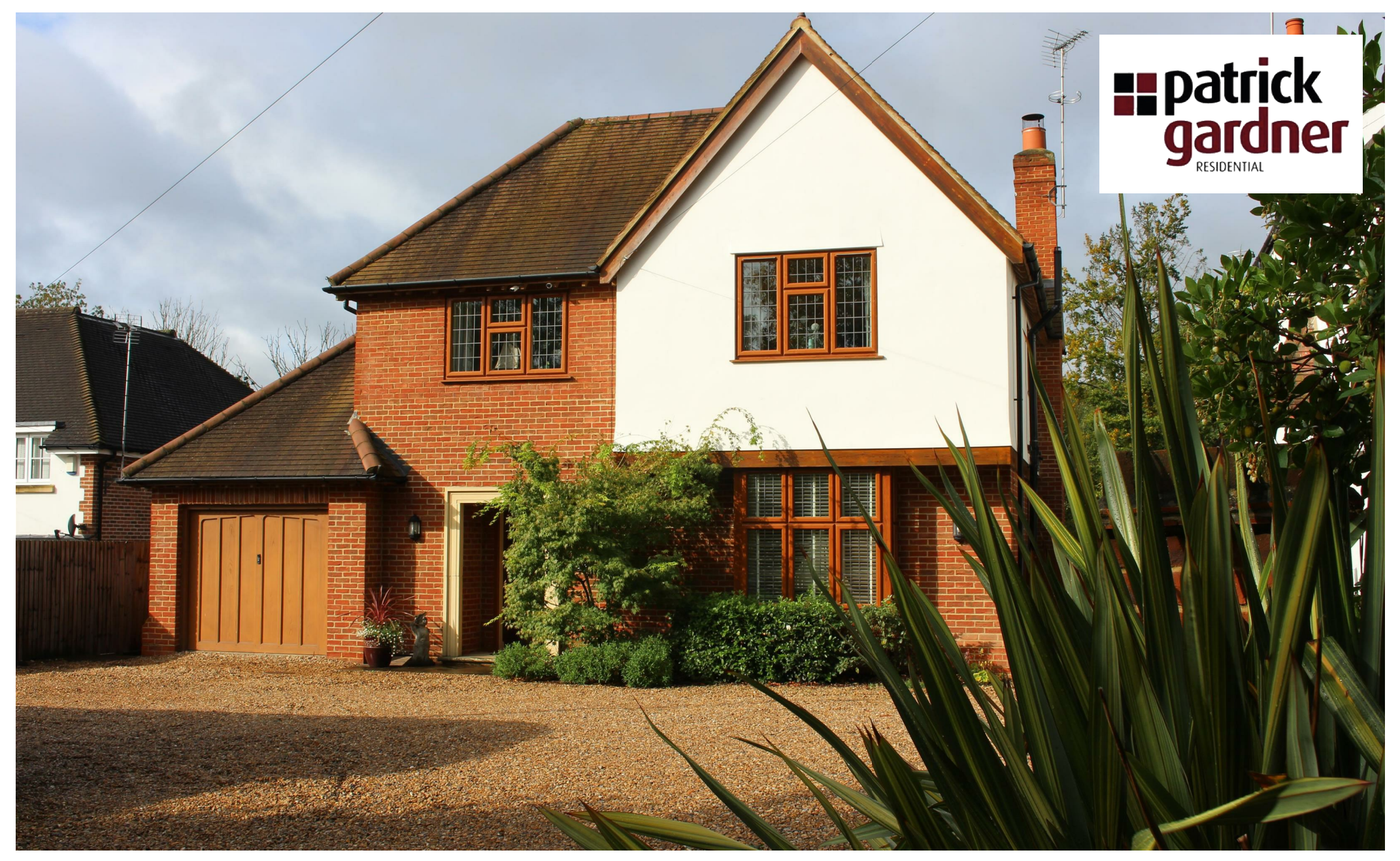
Oak View Oxshott Road, Leatherhead, Surrey, KT22 0EG